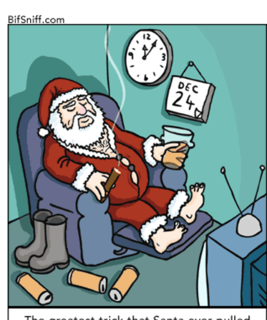
The greatest trick that Santa ever pulled was convincing the world he didn't exist.